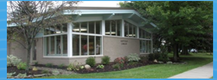
The Mayville Library

If your child completes their gameboard (gr. pk-3) OR reads and passes their Accelerated Reader test in school (gr. 4-6) by Tuesday January 4th , they will be rewarded with: