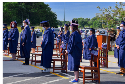
The Class of 2020 celebrated with an outdoor, socially distanced commencement ceremony.

Thank you again to everyone that has supported the Class of 2020 over the years. We feel confident that we have provided our graduates with the foundation they need to excel in an ever-changing environment. We are excited to see what the future holds for this dynamic and positive group of seniors!